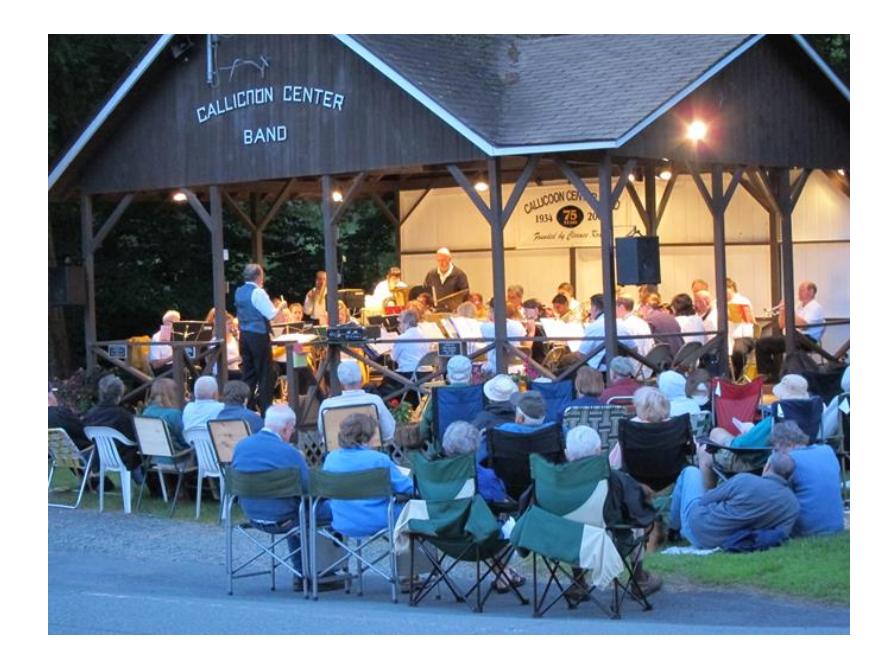
BONUS: Click this picture and watch the Trailer for Town Band now!

We are getting a lot of work done in the editing room for Town Band and we can't wait to share our work with you. If you can't wait any longer, in-person performances may be beginning as soon as August!