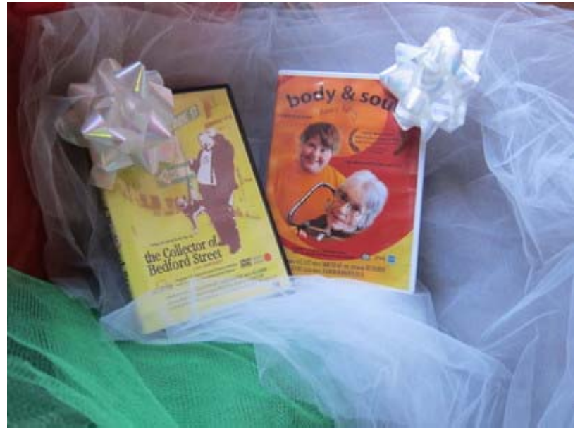
CLICK HERE to purchase Body & Soul: Diana & Kathy

CLICK HERE to purchase The Collector of Bedford Street